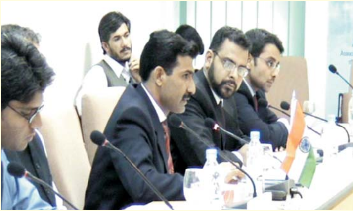
Group B - India "Peace Parleys"