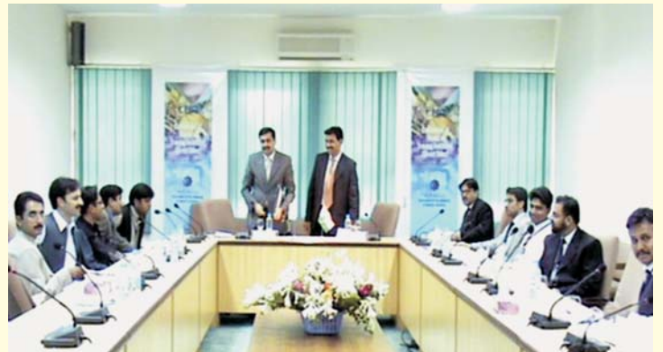
Group B - "Peace Parleys"