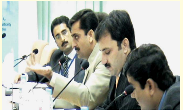
Group B - Pakistan "Peace Parleys"