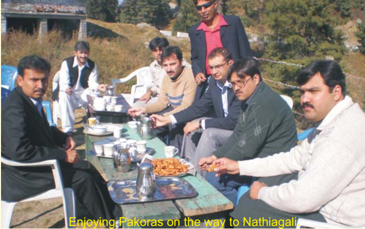
Enjoying Pakoras on the way to Nathiagali.

internal taxes were being brought together under one roof in RTO and LTUs for improved administration and facilitation of the taxpayers. He impressed upon the young officers for their commitment towards their