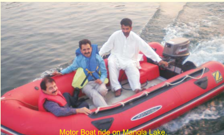
Motor Boat ride on Mangla Lake.