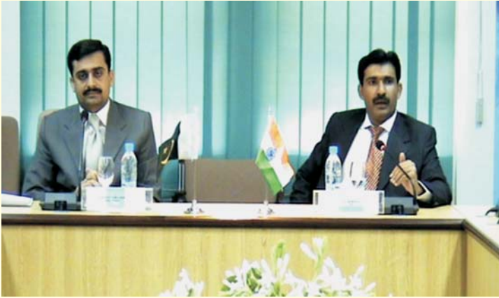
Group B: Press Conference