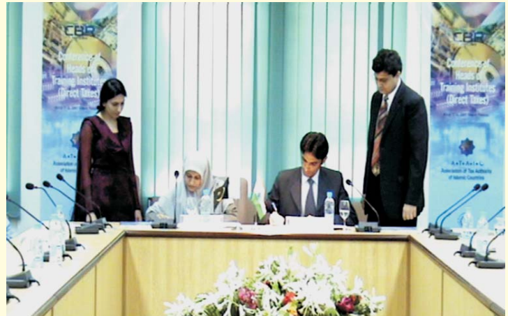
Group A - "Signing of Treaty and exchange of documents"