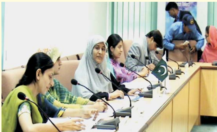
Group A - Pakistan: Treaty Parleys