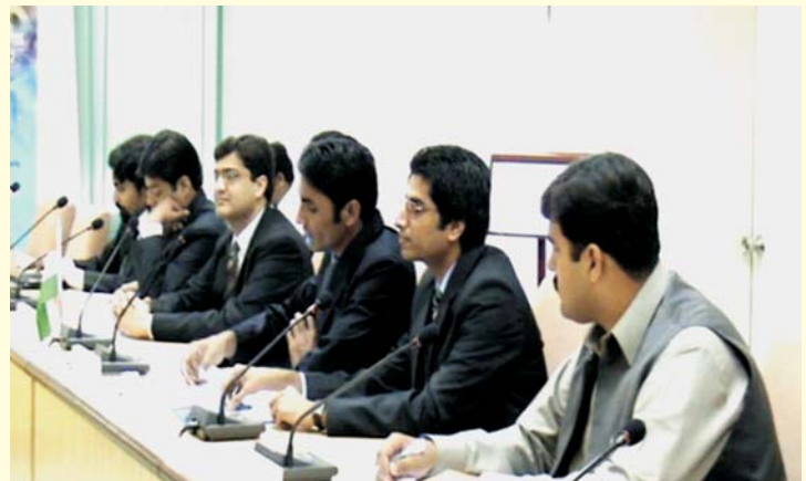
Group A - India: Treaty Parleys