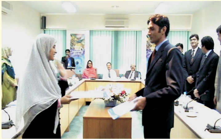
Group A - "Commencement of final day of Negotiations"