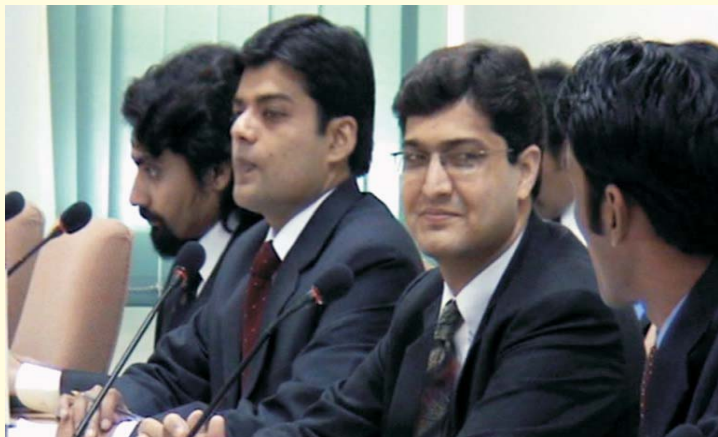
Group A - Pakistan: Treaty Parleys