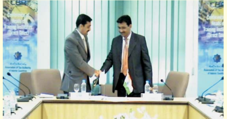
Group B: Signing of treaty and exchange of documents