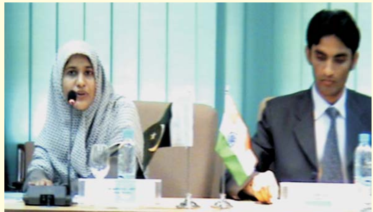
Group A - Press Conference