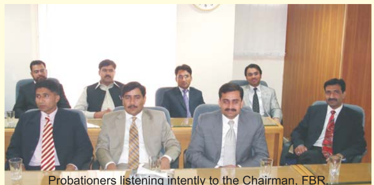
Probationers listening intently to the Chairman, FBR.