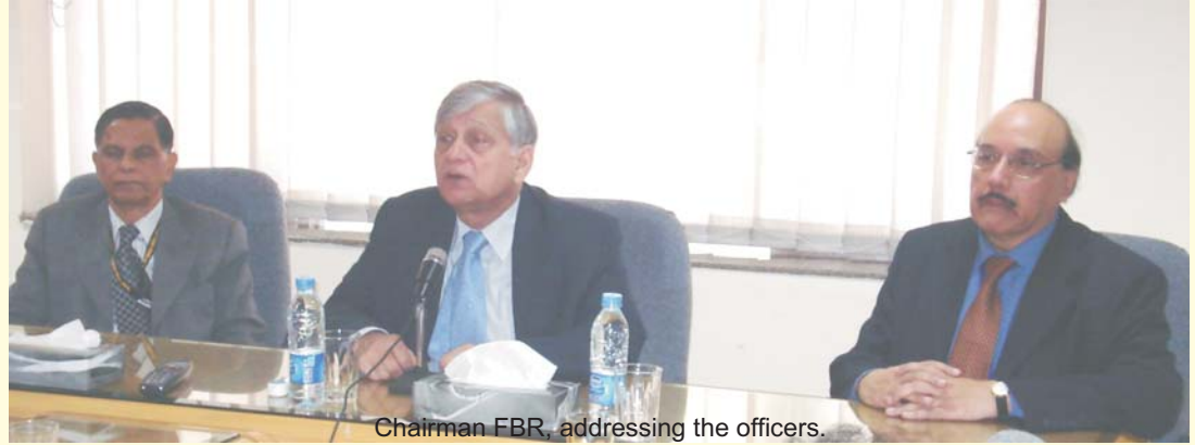
Chairman FBR, addressing the officers.