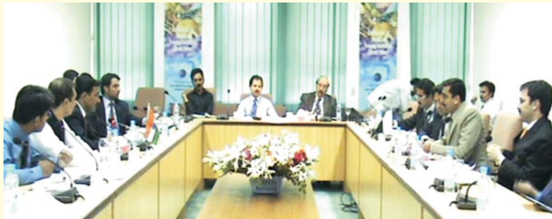
Role Play session in progress

Directorate General of Training & Research (Direct Taxes), Allama Iqbal Town, Lahore. Ph: +92-42-7842710 PABX: +92-42-7830211 Fax: +92-42-7842702 Web: www.dgtrdt.gov.pk email: dg@dgtrdt.gov.pk