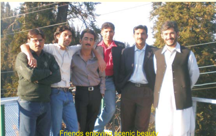
Friends enjoying scenic beauty

system. Previously one officer was assigned a wide range of functions from assessment to collection and the subsequent imposition of penalties. Under reforms, functionalization has been introduced where different jobs were being assigned to different people resulting in specialization of functions and transparency. The work environment in the newly created RTOs and LTUs was extremely conducive to producing quality output at a greater pace. Similarly all